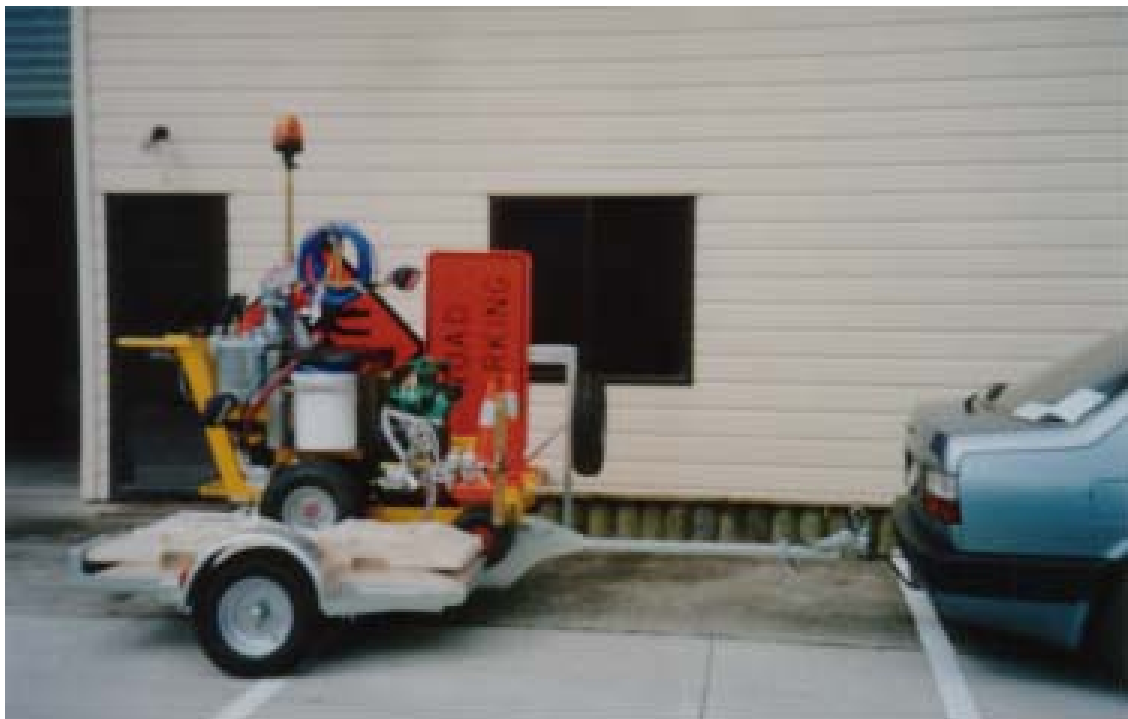
Machine in transport position locked with Pin and tie down ready to drive off