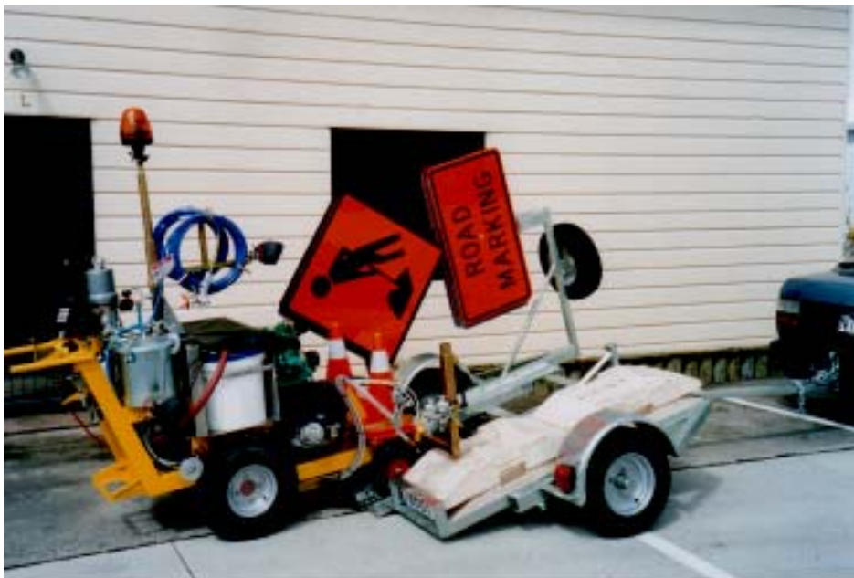
The KADCAM CUB with purpose-built trailer, shown in tilt-down position