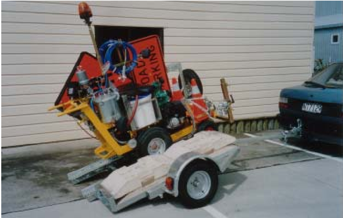
Machine on tilt-trailer engaged in the end position